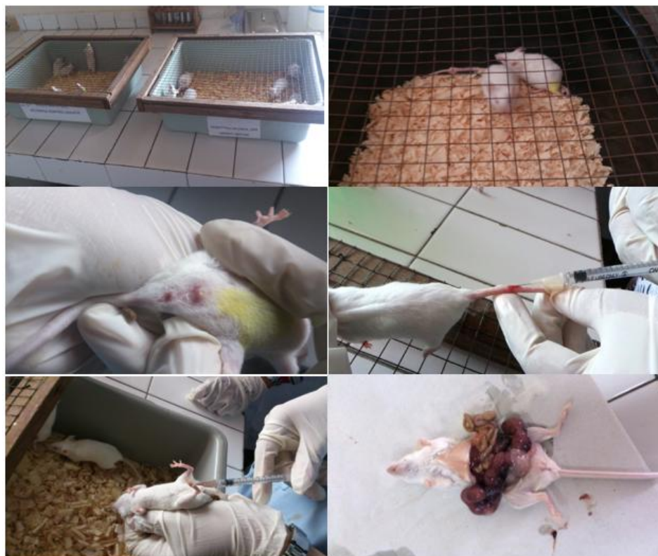
Figure 1. Subject preparation

number on 421-KE-2015 in March 18, 2015.