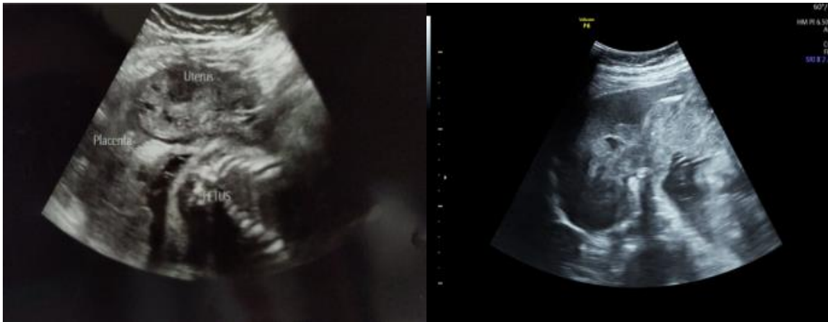
Figure 4. Ultrasound examination indicates a uterus with EL (+) with a live fetus intra-abdominal. Placenta is inserted in the posterior uterine body and peritoneum in the hypochondriac region