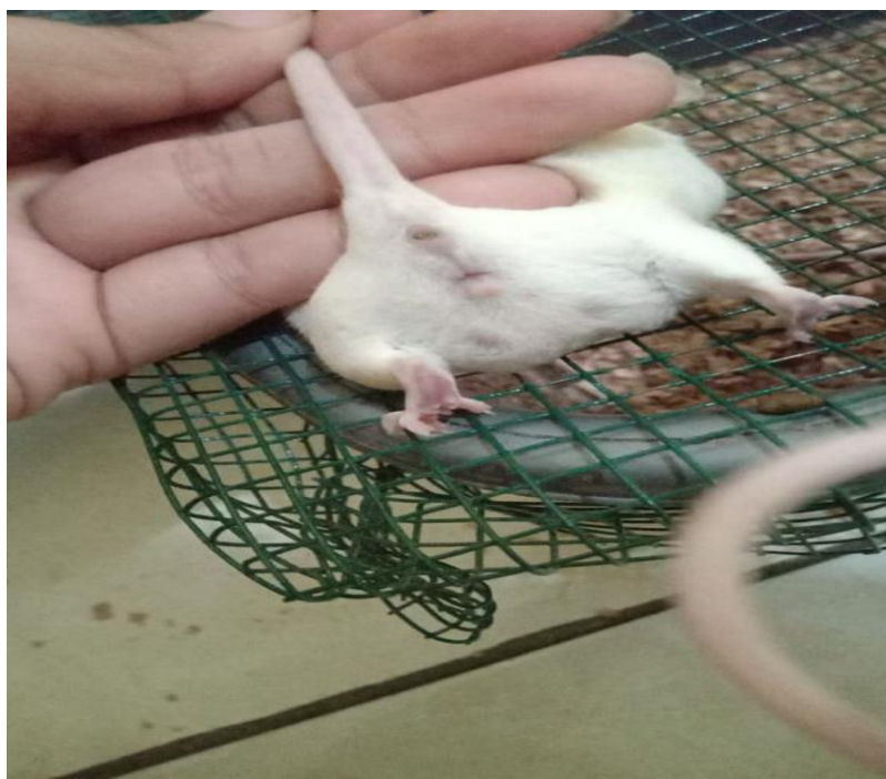
Figure 6. Mice adaptation process

Then separated in a separate cage during pregnancy. The mouse cage used was a plastic box cage measuring 40 x 30 x 18 cm for 5 animals (1 male and 4 female) lined with wood shavings. The frequency of changing the cage mat is done 2-3 times a week.