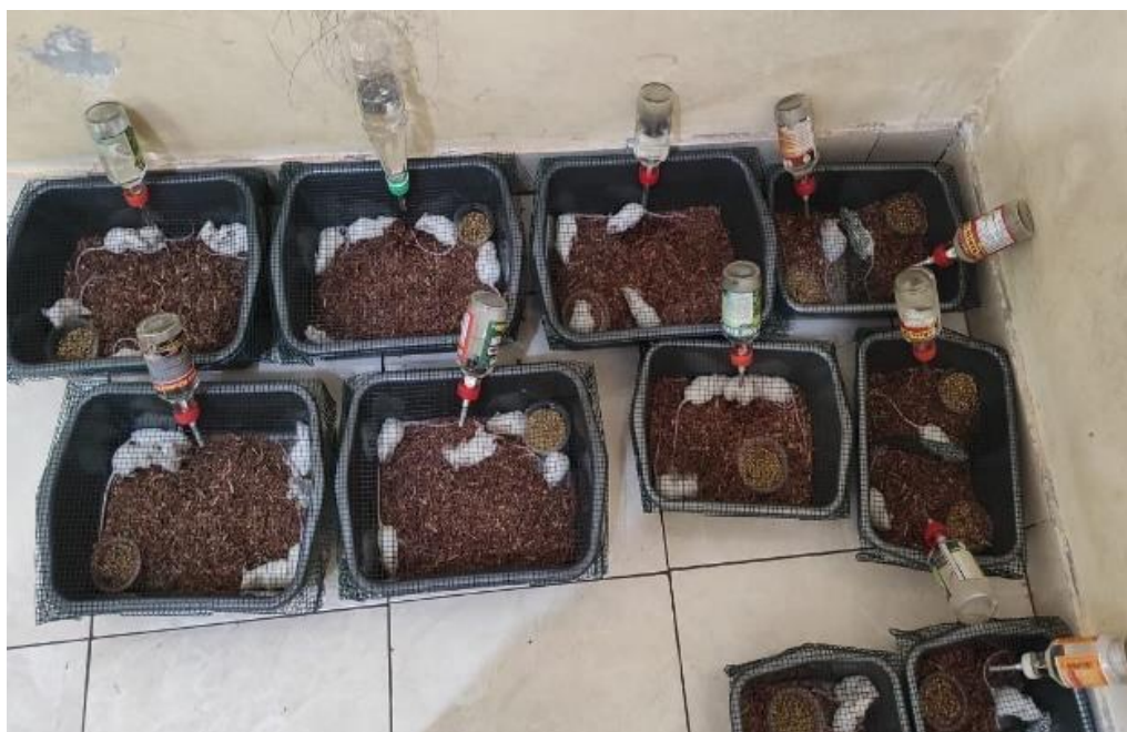
Figure 3. Mice adaptation process

tanks and rearing tanks for each treatment group. Feed mice using Hi-Pro-Vite CP 512B which is high in protein, carbohydrates, fats, minerals and vitamins. Drinking water for mice, which is refilled water that is available at any time by using a bottle with a hole with an aluminum pipe. Data was collected by adapting (acclimatizing) mice for 1 month and the last day of the adaptation process being given worm medicine (Kaufman, 1992). The following is a picture of the adaptation process of mice.