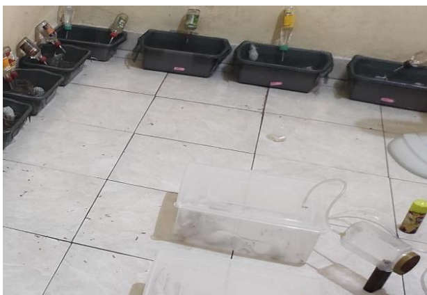
Figure 4. Mice with electric cigarette exposure