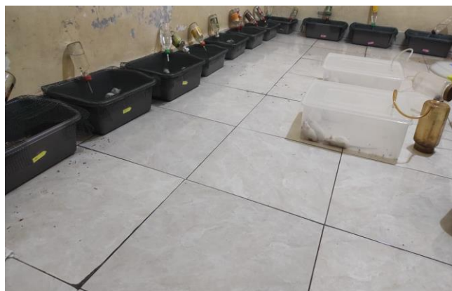
Figure 5. Mice with conventional cigarettes exposure

Mating stage. Female mice were in estrus in a cage with male mice in a mating cage for 7 days with a ratio of 4 female mice and 1 male mouse in 1 cage with their respective labels. If the next day there is a vaginal plug or residual sperm in the vagina of female mice, then that day is day 0 of pregnancy.