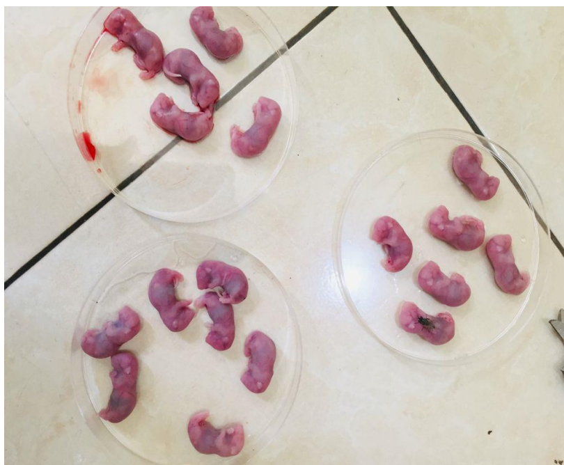
Figure 7. Right and left fetuses

one by one. Here are pictures of the right and left fetuses that have been isolated.