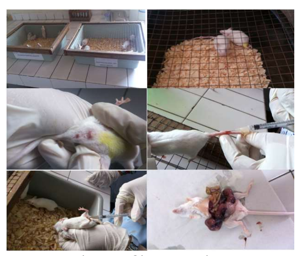
Figure 1. Subject preparation

number on 421-KE-2015 in March 18, 2015.